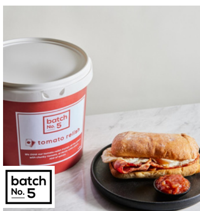
batch No. 5