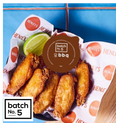
batch No. 5