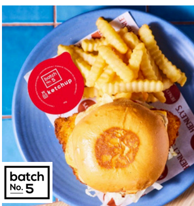
batch No. 5