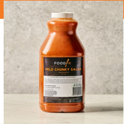
Bulk Mild Chunky Salsa