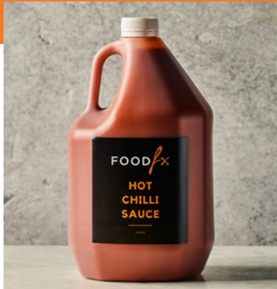
Bulk Hot Chilli Sauce