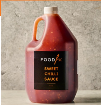
Bulk Sweet Chilli Sauce